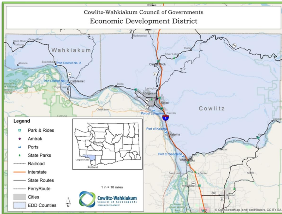
Figure 1 Economic Development District Map

The Economic Development District (EDD) encompasses Cowlitz and Wahkiakum Counties, spanning 14,303 square miles located in Southwest Washington. The two-county region contains six incorporated