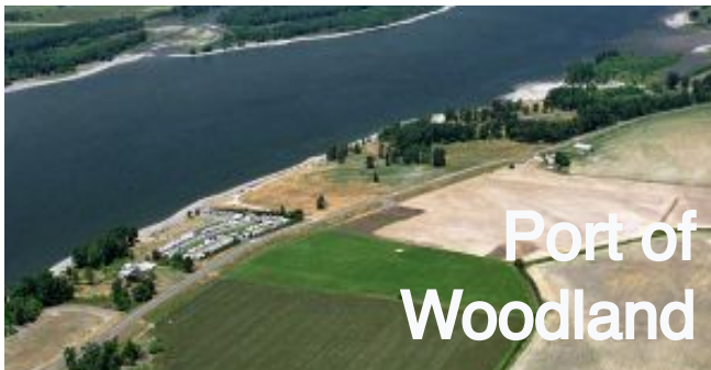
Port of Woodland