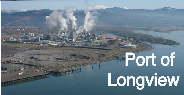
Port of Longview