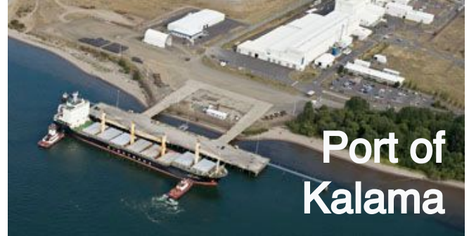
Port of Kalama