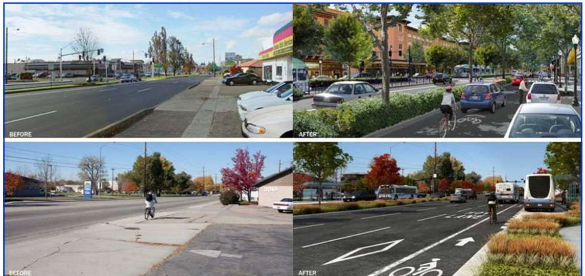
Boise, Idaho "before" and "after" Great Streets improvements

Participants will have the opportunity to provide comment on transportation issues and concerns and to make suggestions about improvements.