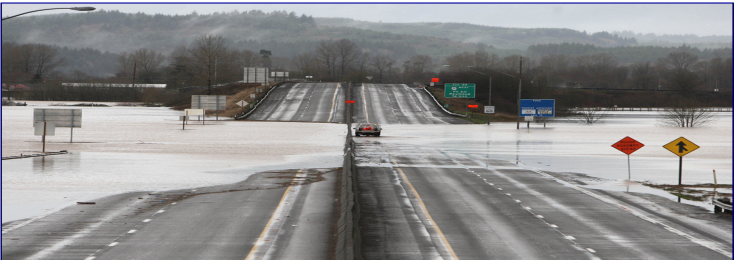
Flooding impact to Lewis County in 2007.